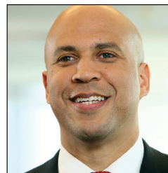
Hon. Cory Booker