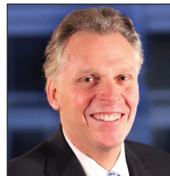
Hon. Terry McAuliffe