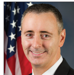
Hon. Brian Fitzpatrick