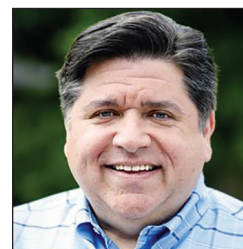
Hon. J.B. Pritzker