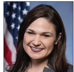
Hon. Abby Finkenauer