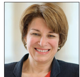
Hon. Amy Klobuchar