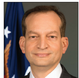
Hon. Alexander Acosta