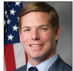
Hon. Eric Swalwell