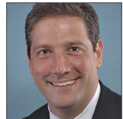
Hon. Tim Ryan