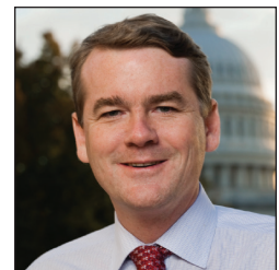
Hon. Michael Bennet