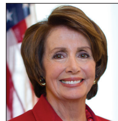
Hon. Nancy Pelosi