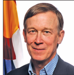
Hon. John Hickenlooper

Please schedule meetings with your Congressional members if you haven't already had the opportunity to do so. Our voices and our issues must be heard.