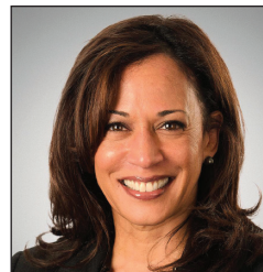
Hon. Kamala Harris