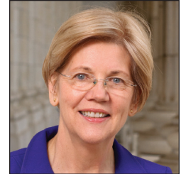
Hon. Elizabeth Warren